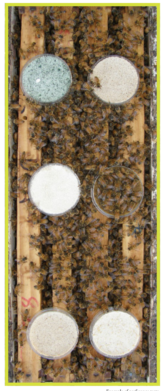
Example of preference tests. Bees were most attracted to the pollen control, centre right

The harsh conditions led to 50% of the control hives (n=6, where three were with pollen traps and three without traps), 66% of defatted soya bean flour fed hives and one hive fed the soya bean protein isolate (PI) with 10% oil diet to die out. The replicate number chosen for the trial was three hives per treatment. In hindsight, because of the harshness of the conditions the number of replicates should have been elevated to enhance the chances of obtaining statistical significance between treatments. However, the developed diet did allow the bees to survive by consuming 0.15−0.39 g/day (pollen diet was consumed at 2.61−6.53 g/day) compared to the Feedbee™ diet at 0.42−1.61 g/day. The only hive