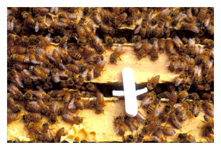
Figure 5. Checkmite strip hanging between frames. Notice how bees initially avoid the strip.

Relying on a single compound to kill mites has caused mites to become resistant to Apistan. To solve this problem, Checkmite strips containing coumaphos have been made available (Figure 5). These strips will work to control varroa mites even if they are resistant to Apistan and currently they are very effective. Be sure to use gloves because Coumaphos is an organo-phosphate (a nerve toxin). All of the cautions about not leaving Apistan strips in colonies when the honey supers are on also apply to Checkmite strips, but it is also illegal to harvest comb honey from a hive that had been treated with Coumaphos. Coumaphos can also harm developing queens. Never use checkmite strips in a colony that is rearing gueens. The label states that maximum efficacy can be obtained by leaving strips in the colony for 42 days. However, to avoid excessive exposure of this pesticide to the bees and contamination of wax, consider leaving the strips in for just two weeks (the time that brood remains sealed), rather than the maximum time specified on the label.