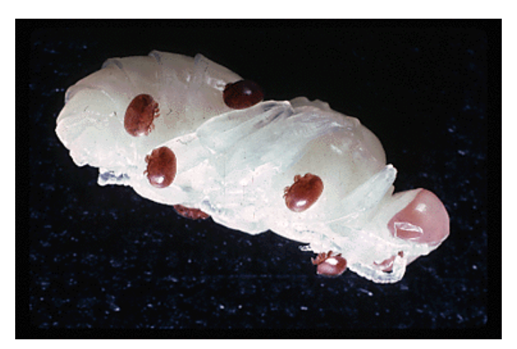
Figure 3. Drone pupa with adult mites on it. Drones can be recognized because they are larger in size and have larger eyes than workers. Varroa prefer drone cells over worker cells.

bees vigorously, and count the number of mites that stick to the sides of the glass. This method, sometimes called the "ether roll test," is very fast, and gives you a rough idea of how many mites are present. If you see 15 or more mites in the sample, it is probably time to treat for mites (see Control). Varroa mite populations grow rapidly during the summer.