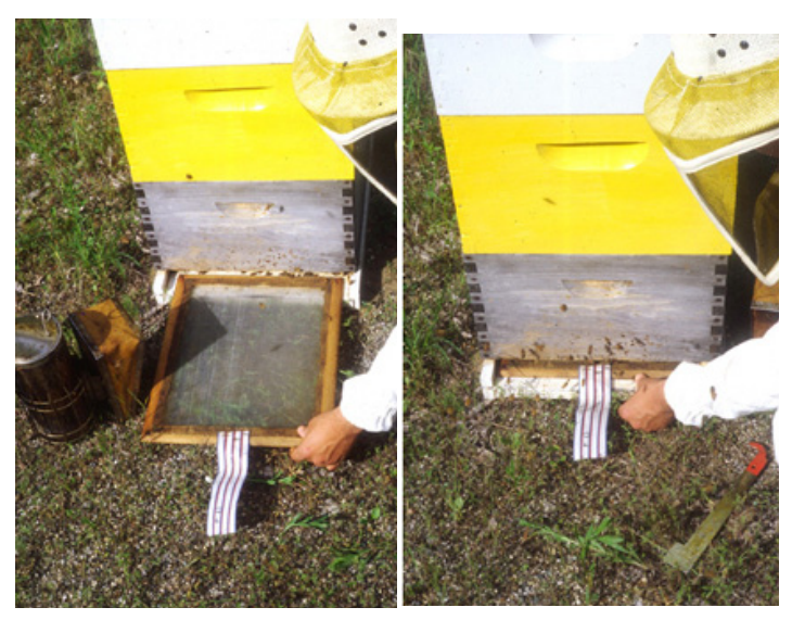
Figure 4. Inserting a "sticky board" to check the population of Varroa mites in a colony.

Some sticky boards are commercially available. To make your own sticky board, buy some 3/8 inch wooden door stop material, and make a frame that is almost as big as the hive bottom board but that can still fit into the hive entrance.