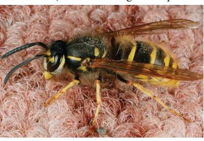
Figure 2. Yellow Jacket (Vespula vulgaris)

1). Although solitary bees, such as sweat bees and carpenter bees, can inflict a sting, the risk of an allergic response to their venom is low because they are both unaggressive and the amount of venom they inject is low. More aggressive, primitively social paper wasps, yellow jackets, bald-faced hornets and European hornets from the Family Vespidae (Figures 1 - 4) – as opposed to eusocial honey bee workers from the Family Apidae – can sting more than once. If the flying stinging insect that inflicts a sting is unidentified, most often (unless the sting is still present