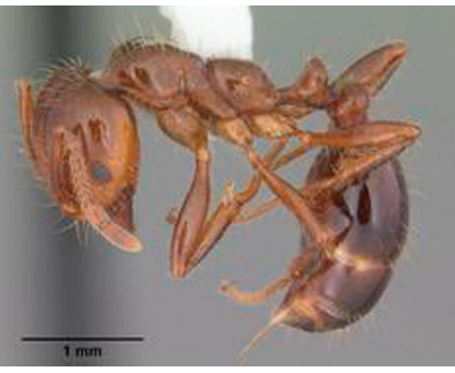
Figure 5. Imported Fire Ant (Solenopsis invicta), courtesy of Deyrup and Cover, antweb.org

in the victim) the culprit was not a honey bee. Sting incidence in America varies with region. Yellow jackets are more populous than honey bees in the north, wasps are more prevalent in the southwest, and fire ants are more prevalent in the southeast. Imported fire ants - Family Formicidae, genus Solenopsis - also have a sting apparatus (Figure 5). And their venom is the most potent venom known in the animal kingdom! A general approximation of flying insect sting incidence throughout the US is yellow jackets (Vespula and Dolichovespula) 50 %, honey bee (Apis) 25 %, paper wasp (Polistes) 15 %, bumble bee (Bombus) 5 %, and European hornet (Vespa) 5 %.