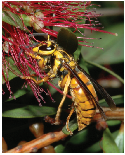
Figure 4. European Hornet (Vespa crabro), Buddy Marterre, MD