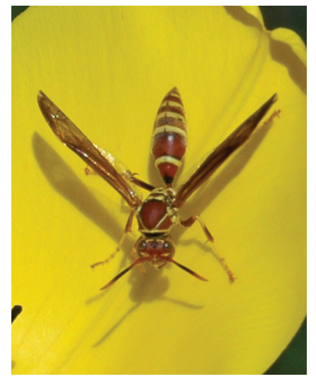
Figure 1. Wasp (Polistes sp.), Buddy Marterre, MD

The order Hymenoptera includes ants, bees, hornets, and wasps, many of which inflict stings (Table