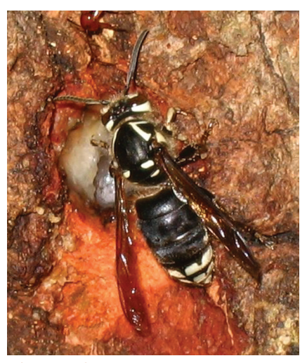
Figure 3. Bald Faced Hornet (Dolichovespula maculata)